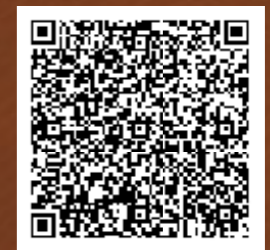
MahaRERA QR Code