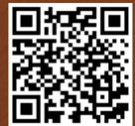
LOCATION QR Code