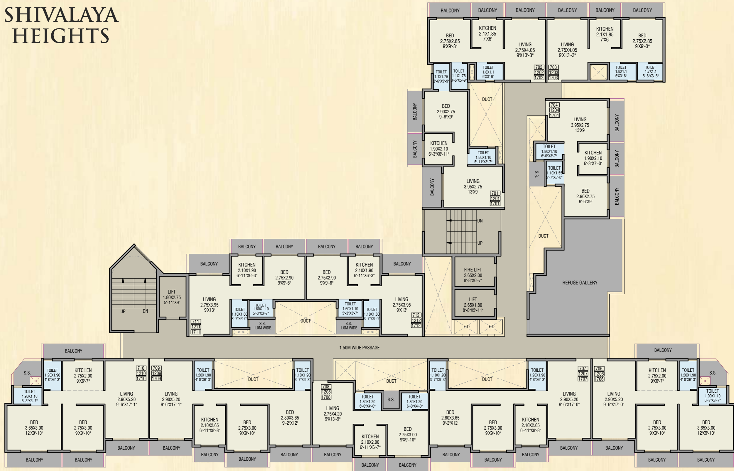
7 TH , 12 TH & 17 TH FLOOR PLAN